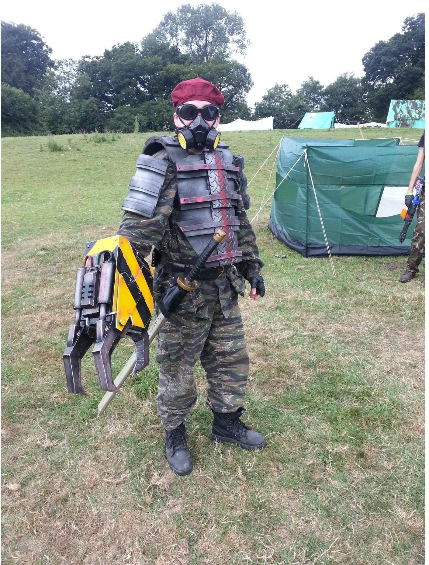
Owner of our Power Claw – Green Cloaks System