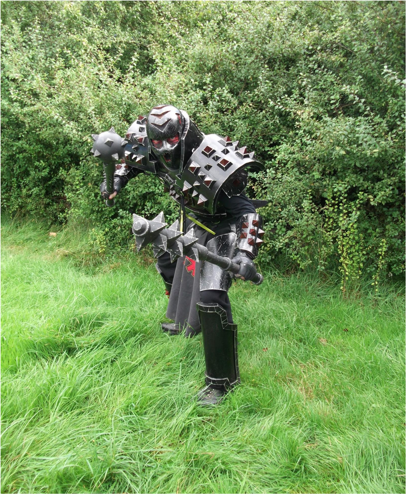
Spike of the Amagos – Curious Pastimes System