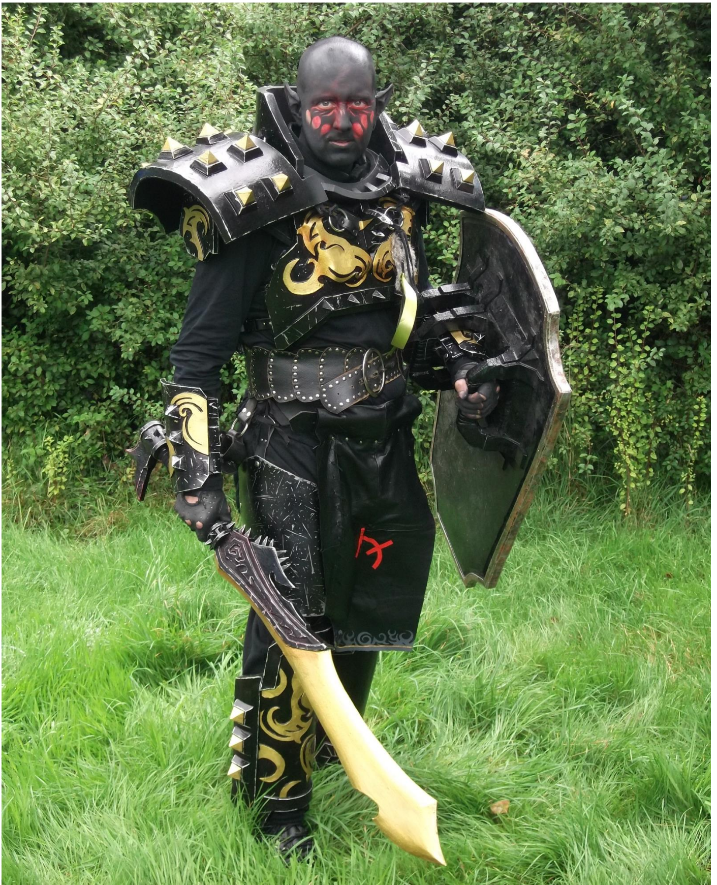
Damij of the Amagos – Curious Pastimes System